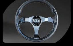
Luxury steering wheel