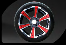
14" Alum Wheel with black insert/215/35R14 Radial DOT Tire