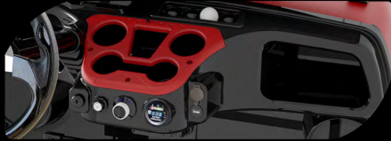
Color matched Dash with four cup holders/cell phone holder