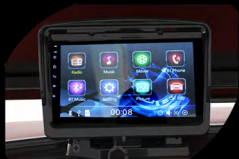
9 inch touchscreen with back-up camera