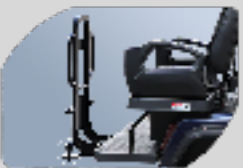
Rear Handrail with Optional Towing Hitch Receiver