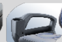
Rear Armrest With Built-in Storage Compartment