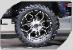
Silent Tire with Off-road Thread