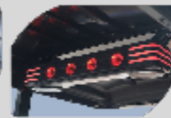
Cuboid Evolution Sound Bar