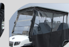
Optional All-Weather Enclosure