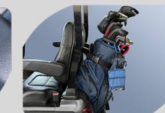
Optional Golf Bag Holder