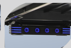
Cuboid Evolution Sound Bar