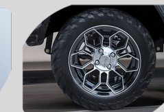
Silent Tire with Off-road Thread