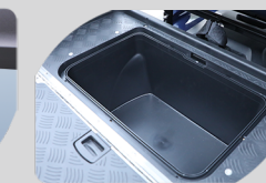
Rear Storage Compartment