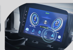
9" Touchscreen with Carplay Compatibility