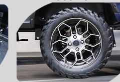
Silent Tire with Off-road Thread