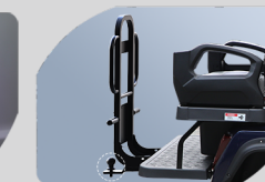
Rear Handrail with Optional Towing Hitch Receiver