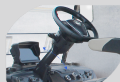
Adjustable Steering Column