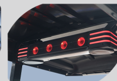
Cuboid Evolution Sound Bar