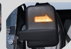
Powered Rear View Mirrors