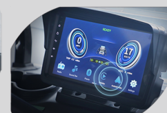
9" Touchscreen with Carplay Compatibility