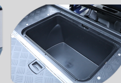
Rear Storage Compartment