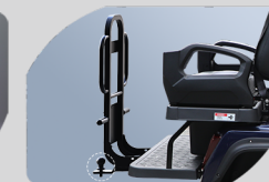
Rear Handrail with Optional Towing Hitch Receiver