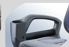
Rear Armrest With Built-in Storage Compartment