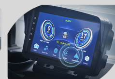
9" Touchscreen with Carplay Compatibility