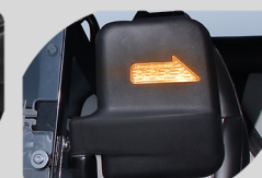
Powered Rear View Mirrors