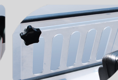
Slideable Air Vents