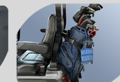
Optional Golf Bag Holder