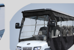
Optional All-Weather Enclosure