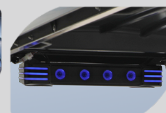
Cuboid Evolution Sound Bar